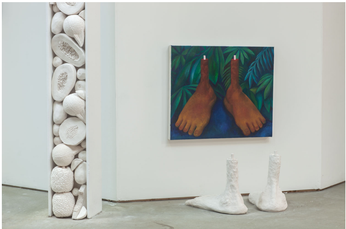
Ruskin MFA Degree Show, Installation View, Ruskin School of Art, 2016