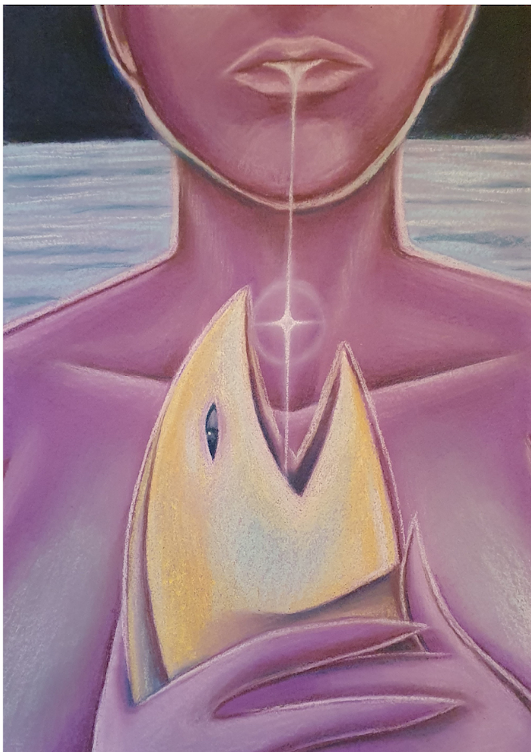
Alicia Reyes McNamara The taste of salt 2020 pastels and coloured pencil 21 x 29.7 cm £200