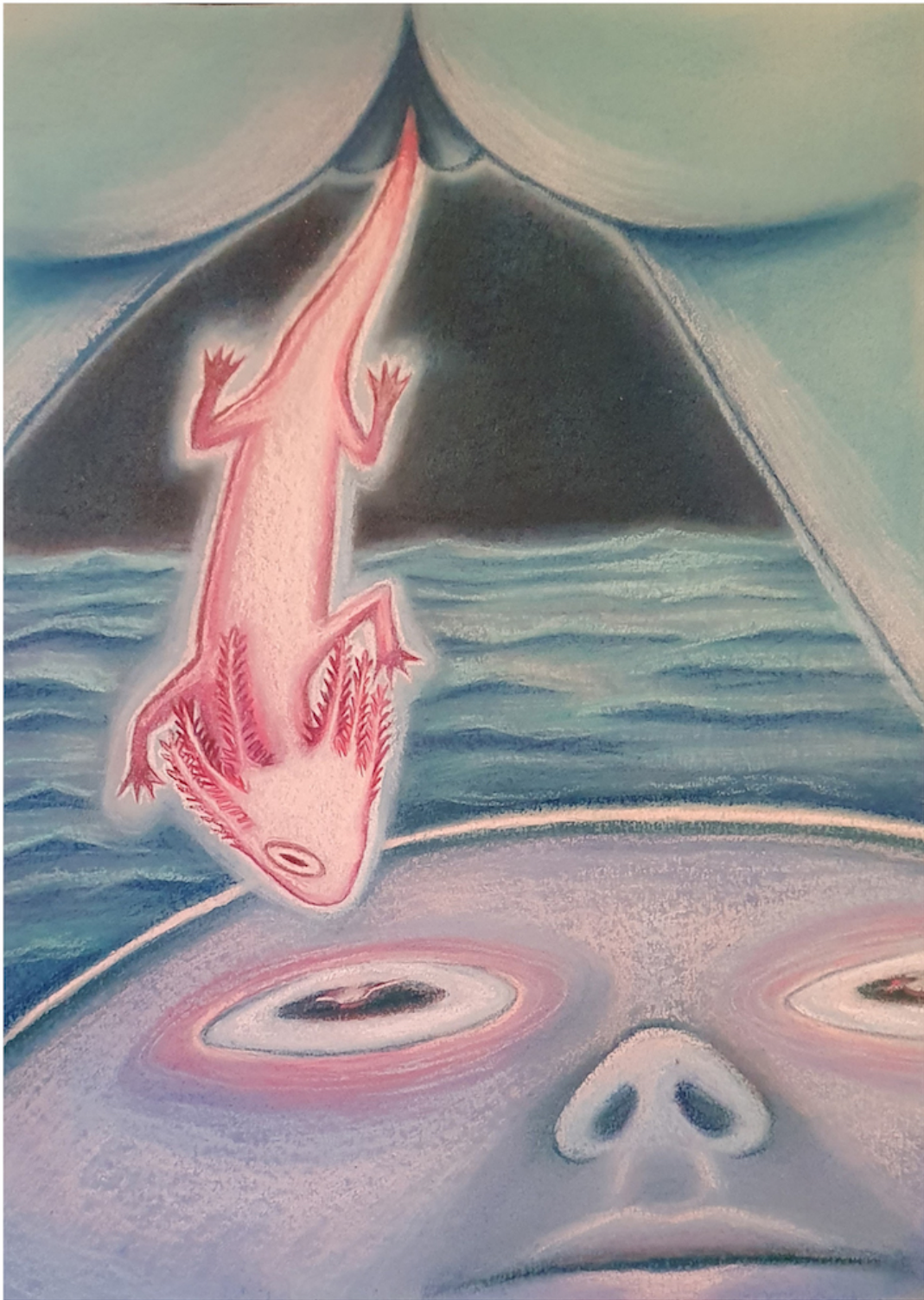
Alicia Reyes McNamara Eye to eye 2020 pastels and coloured pencil 21 x 29.7 cm £200