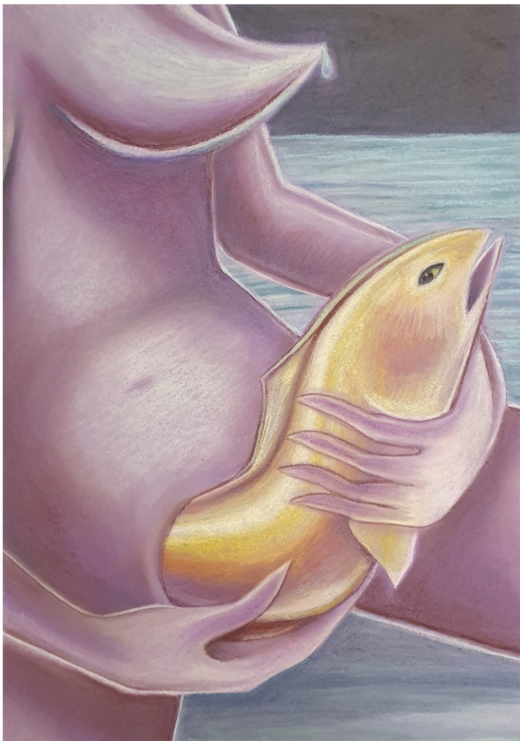
Alicia Reyes McNamara From within 2020 pastels and coloured pencil 21 x 29.7 cm £200