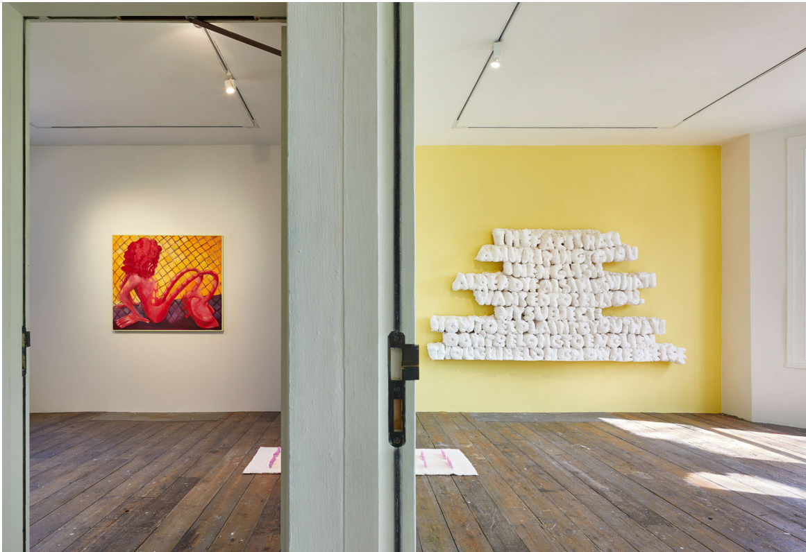
Nowhere Else , Installation View, South London Gallery, 2017