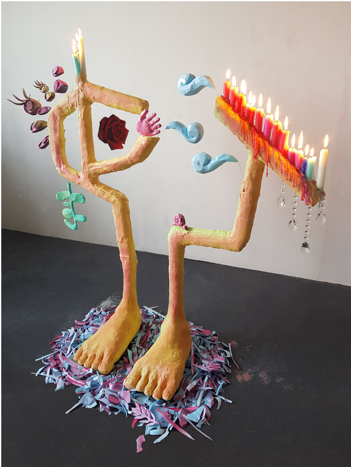
Alicia Reyes McNamara Conjurer 2018

ceramics, plaster, polystyrene, spray paint, wire, candles and prisms 145 x 135 x 60 cm