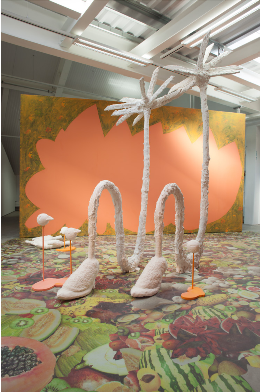
Ruskin MFA Degree Show, Installation View, Ruskin School of Art, 2016