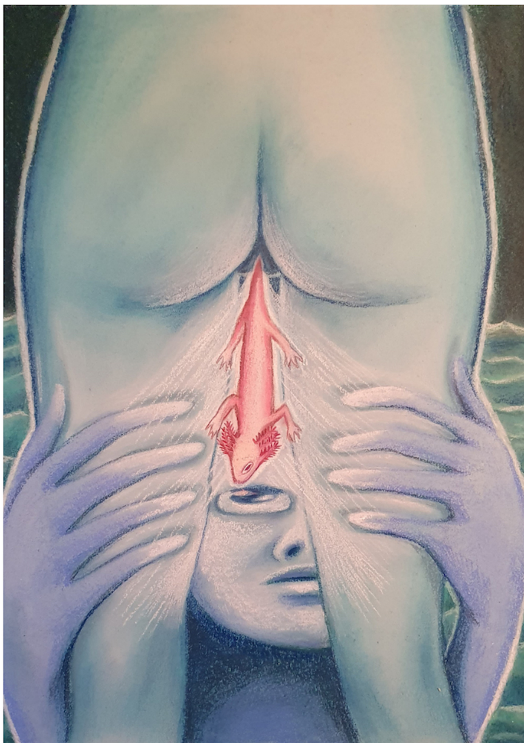
Alicia Reyes McNamara The eyes below 2020 pastels and coloured pencil 21 x 29.7 cm £200