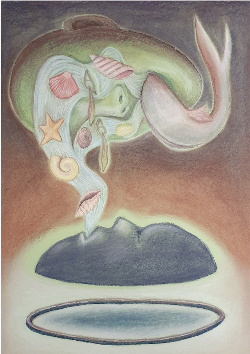
Alicia Reyes McNamara The way they spoke 2020 pastels and coloured pencil 21 x 29.7 cm £200